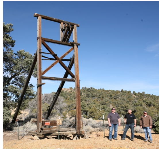
Fig 2: NLR Management at Golden Pipe Mine Shaft