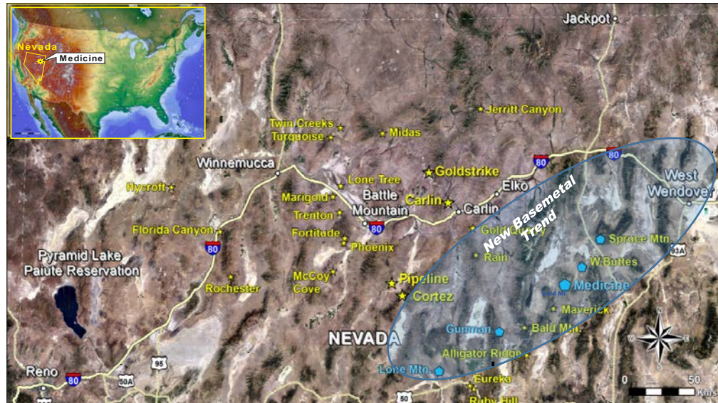
Fig 1: New Basement Trend in North Eastern Nevada